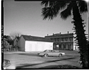
3. Historic American Buildings Survey, February, 1979 VIEW FROM SOUTHEAST. HABS TEX,31-BROWN,7-3