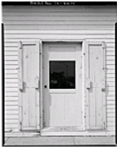
5. Historic American Buildings Survey, Bill Engdahl for Hedrich-Blessing, Photographers, February, 1979 FAR RIGHT SIDE ENTRANCE DOOR, OPEN. HABS TEX,31-BROWN,7-5