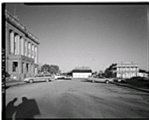
1. Historic American Buildings Survey, Bill Engdahl for Hedrich-Blessing, Photographers, February, 1979, 11TH STREET PERSPECTIVE FROM SOUTHWEST, HABS TEX.31-BROWN.7-1