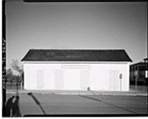
2. February, 1979 SOUTHEAST ELEVATION ON 11TH STREET. HABS TEX,31-BROWN,7-2