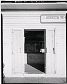
4. Historic American Buildings Survey, Bill Engdahl for Hedrich-Blessing, Photographers, February, 1979 SIDE ENTRANCE DOOR (SECOND ENTRANCE DOOR FROM LEFT) OPEN. HABS TEX,31-BROWN,7-4