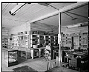
8. STORE INTERIOR.