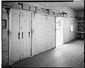
7. Historic American Buildings Survey, Bill Engdahl for Hedrich-Blessing, Photographers, February, 1979 SIDE DOORS SEEN FROM INTERIOR. HABS TEX,31-BROWN,7-7