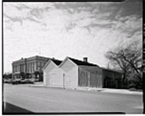
6. Historic American Buildings Survey, Bill Engdahl for Hedrich-Blessing, Photographers, February, 1979 VIEW FROM NORTHWEST TO SOUTHEAST. HABS TEX,31-BROWN,7-6